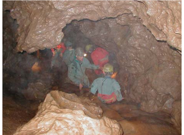
Inside the caves

Boots, coveralls and lights were provided by the centre and three instructors accompanied us. They explained the history of the caves, gave us the names of each chamber.