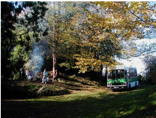
Lunch by the campfire