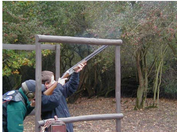
Dead Clay! (12 gauge)