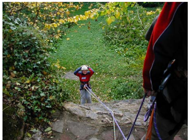
..then, look Mum!, no hands!

Hanging off a thin rope on a vertical drop is not everyone's cup of tea, but all managed.