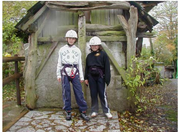
.....to the smallest