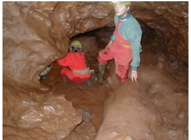
Some parts were smaller than others