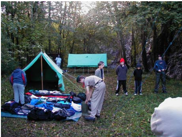
Kit inspection Sunday morning

Then it was time to kit up on Sunday morning for abseiling and climbing.