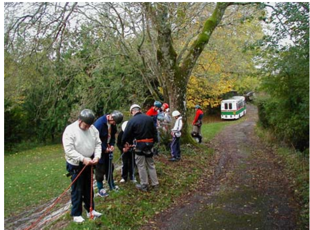
1 st , the nursery slope....

Then it was time to kit up on Sunday morning for abseiling and climbing.