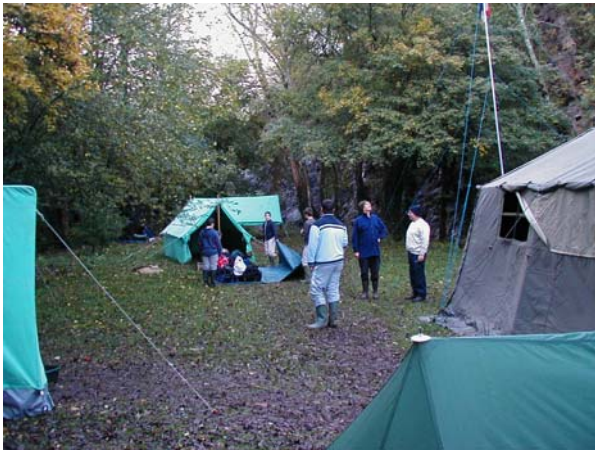
Camp established early Saturday