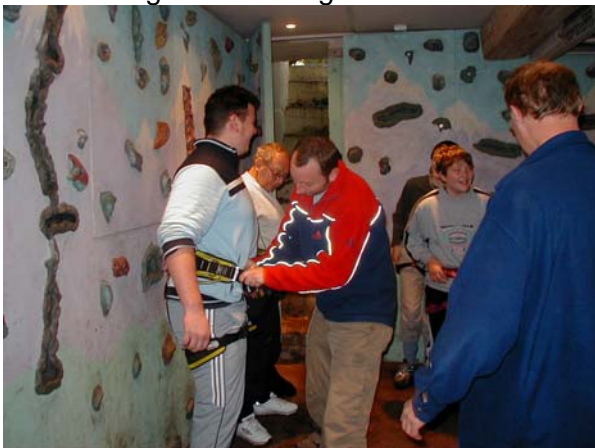
The centre has equipment for the biggest...

The Troop was instructed in proper use of the equipment on the nursery slopes and then went off to tackle some vertical under the supervision of the centre instructors with safety ropes in place to cater for enthusiasm (see "Look Mum!, No hands!").