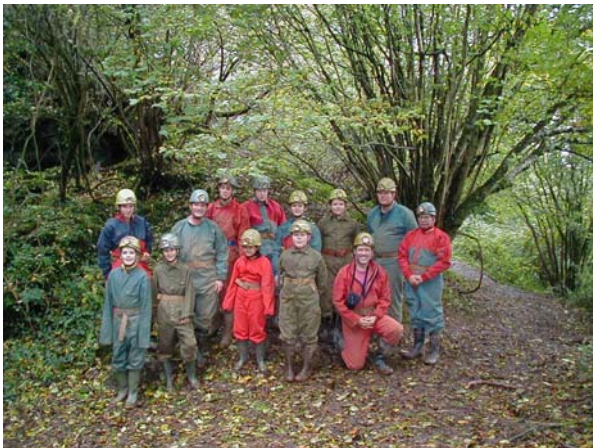
Before going underground

The afternoon was spent underground in the Pridersleigh caves. The Troop split into two teams that ventured several hundred feet underground into the wet and muddy cave system; sometimes with little more space to squeeze through than was absolutely necessary. For some of the leaders this became a physical as well as psychological challenge!