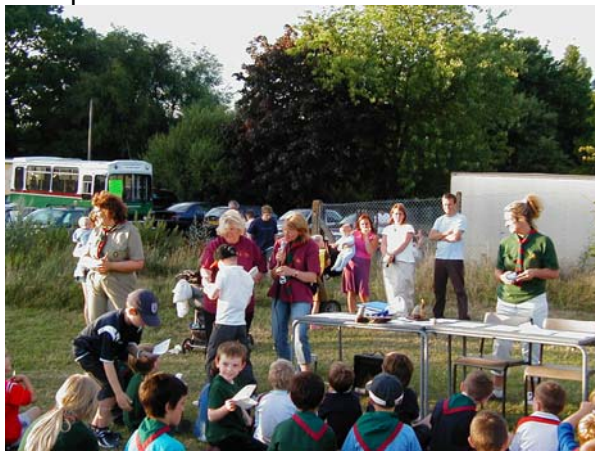
Well done to all Beavers and Cubs for participating. Thank you very much to all the parents for coming along and making it a most worthwhile event. Thank you very much to all the section and unit leaders and Group friends for organising the event, making it happen and being there on the day.