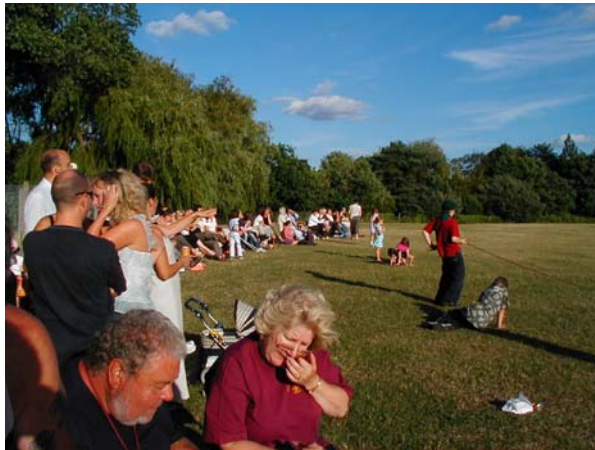
Certificates were awarded at the end and money was raised to help operating our two Group Minibuses.