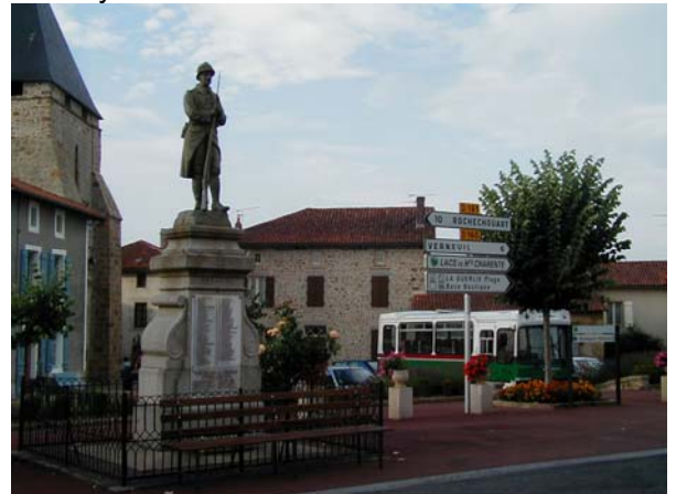
The Scouts arrived late in the afternoon on the Saturday have spent nine hours in a traffic jam on the M25 and waited five hours over Friday night to board a ferry at Dover.