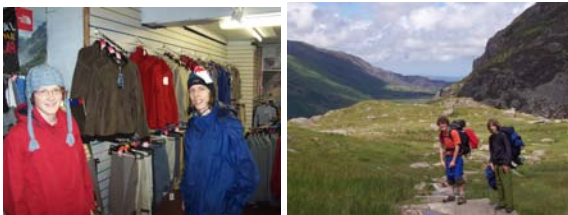
But did get to see some decent scenery....