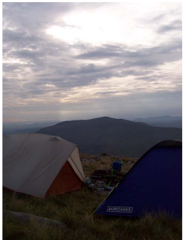
Well done lads and thanks to Gerry McGeehan for supporting them.