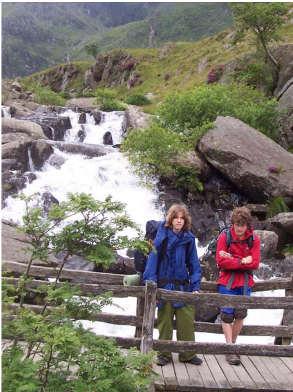
Although the mist and rain was always around and you cannot stop or 'get off the ride' when it occurs. If you can safely do so, you carry on.....