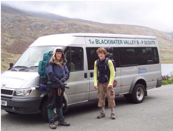
They came across rain and mist, took a break in the local shops and tried local fashions...